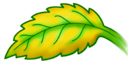
** Interveinal chlorosis, a symptom of iron, zinc and manganese deficiencies, evident in yellow parts of leaf.